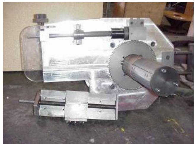
US80 with flange facing attachment